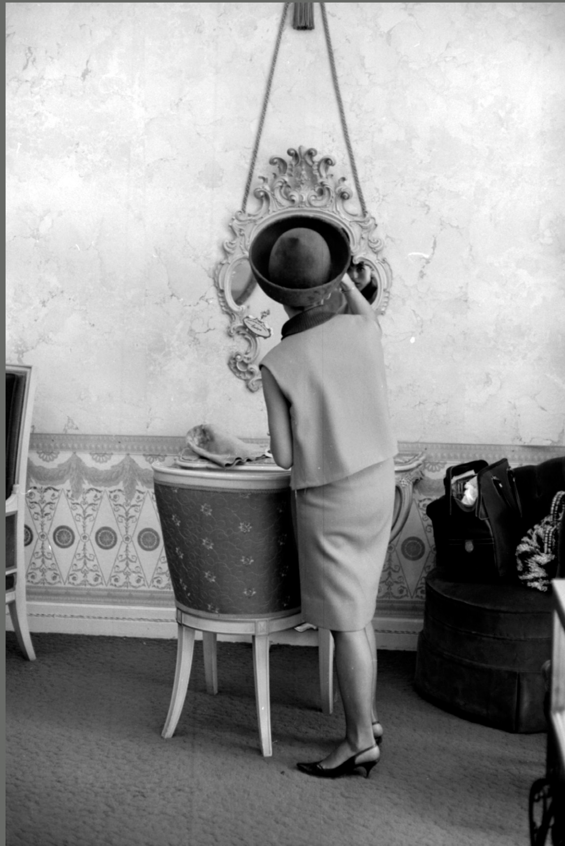
“View of woman shopping in a millinery store in Montreal,” August 1965, The People Tree .